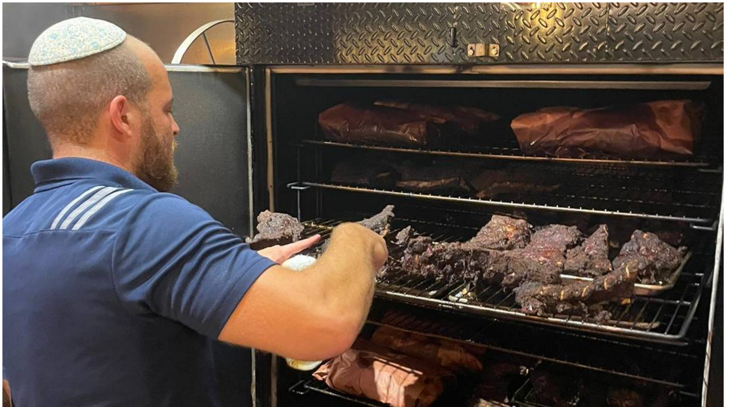
Izzy's Brooklyn Smokehouse is a new kosher barbecue spot in Aventura.