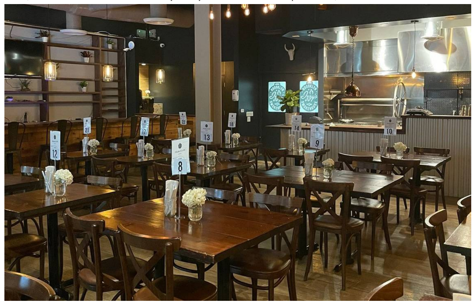
Izzy's Brooklyn Smokehouse is a new kosher barbecue spot in Aventura.

Highlights of Izzy's strictly kosher menu include 18-hour smoked brisket, house-cured pastrami, mammoth beef ribs, smoked lamb and pulled beef or chopped brisket sandwiches.