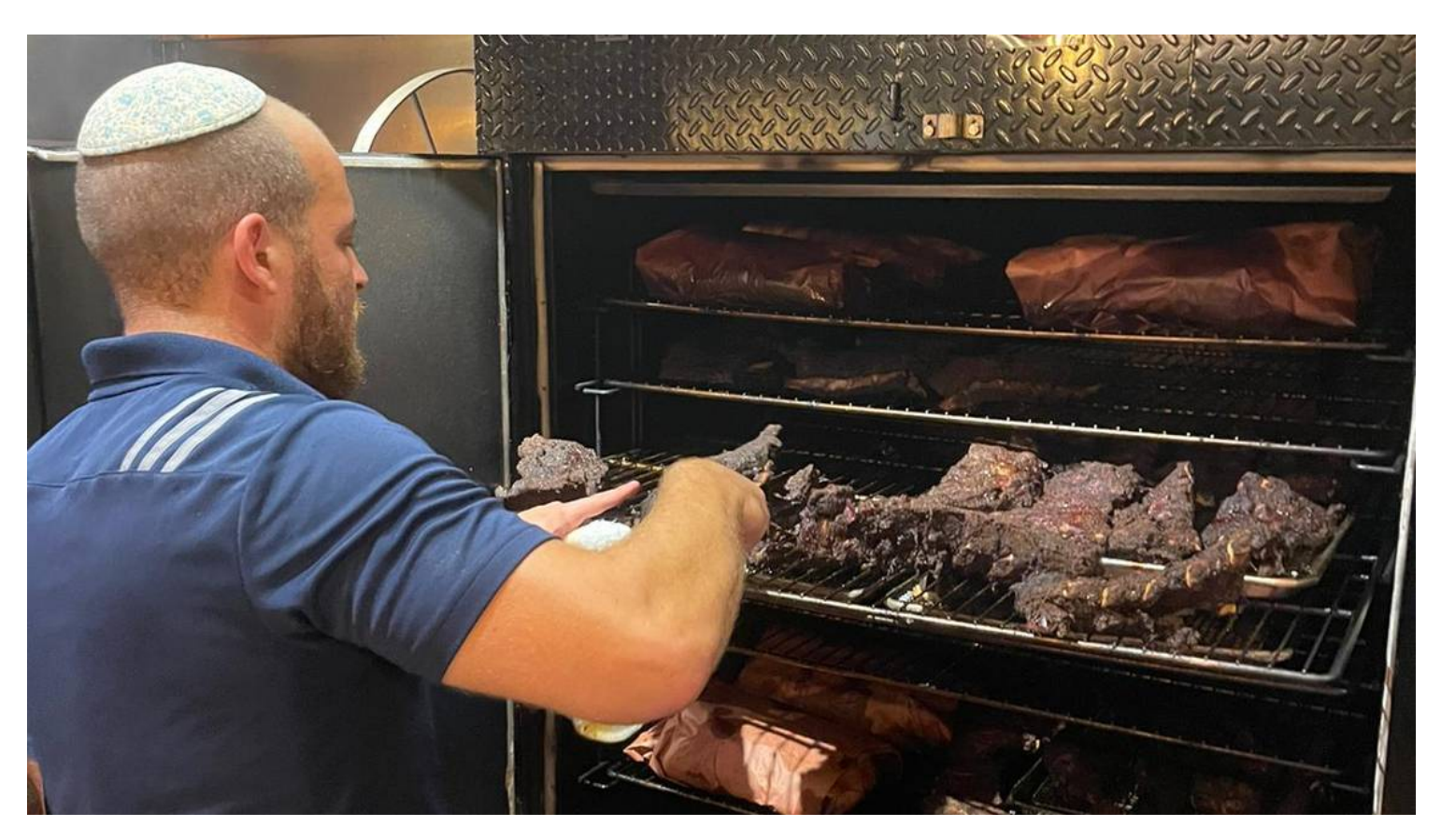
Izzy's Brooklyn Smokehouse is a new kosher barbecue spot in Aventura. HANDOUT